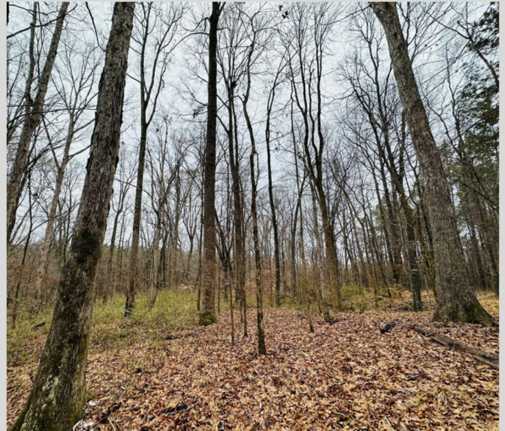
Holmes County, MS | 950 +/- Acres