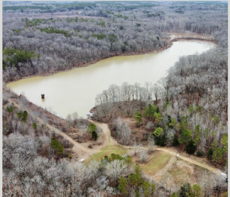
Holmes County, MS | 493 +/- Acres