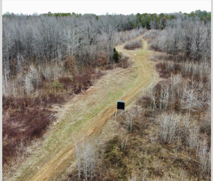
Holmes County, MS | 362 +/- Acres