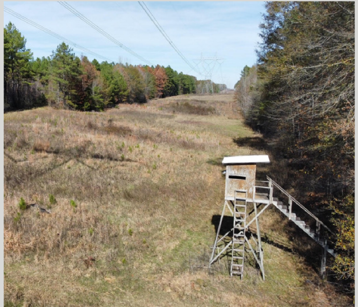
Hinds County, MS | 465 +/- Acres