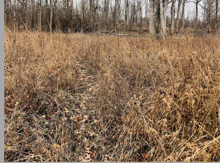
*All information is believed to be accurate but not guaranteed.