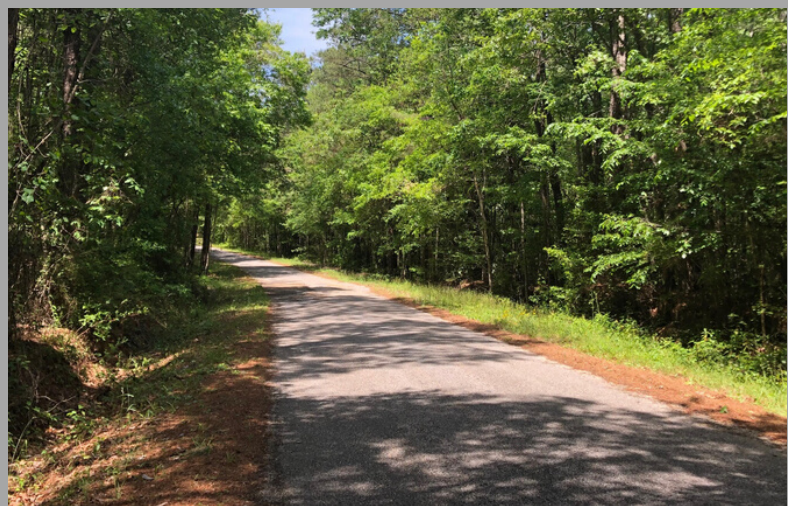
*All information is believed to be accurate but not guaranteed.