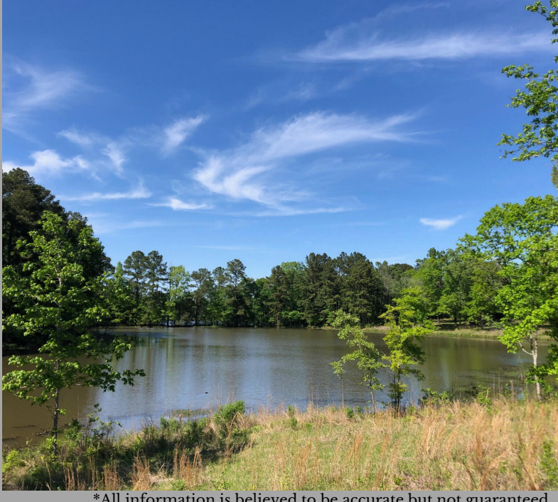
*All information is believed to be accurate but not guaranteed.